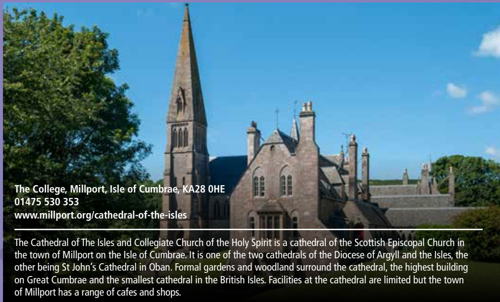
The College, Millport, Isle of Cumbrae, KA28 0HE 01475 530 353 www.millport.org/cathedral-of-the-isles

The Cathedral of The Isles and Collegiate Church of the Holy Spirit is a cathedral of the Scottish Episcopal Church in the town of Millport on the Isle of Cumbrae. It is one of the two cathedrals of the Diocese of Argyll and the Isles, the other being St John's Cathedral in Oban. Formal gardens and woodland surround the cathedral, the highest building on Great Cumbrae and the smallest cathedral in the British Isles. Facilities at the cathedral are limited but the town of Millport has a range of cafes and shops.